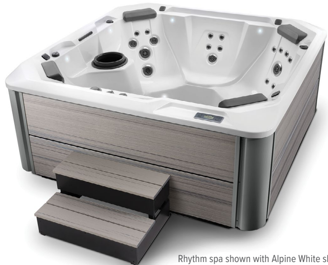
Rhythm spa shown with Alpine White shell, Almond cabinet and Almond Hot Spot Collection Step.